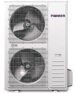
Outdoor Condensing Unit