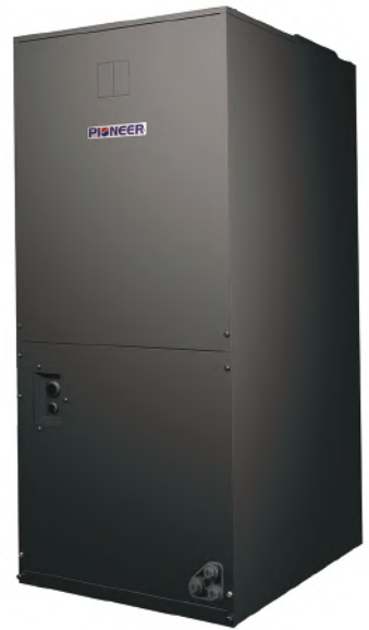
Ducted Air Handler Unit