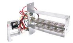
10 kW Heater (w/ breaker)