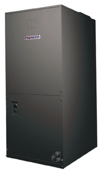
Ducted Air Handler Unit