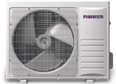
Outdoor Condensing Unit