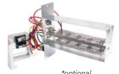
10 kW Heater (w/ breaker)