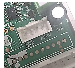
Figure 4 - CN40 on ceiling units (4-pin connector) for the wired thermostats.