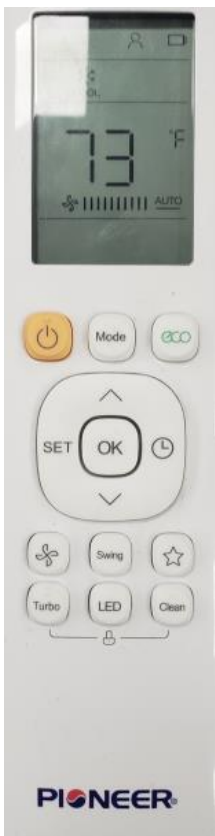
Figure 1 - RG10A, the “SET” button on the left side.